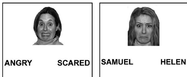
Figure 1. The left panel is an example of an affect labeling trial in which participants select the appropriate affect label characterizing the facial expression of the target face. The right panel is an example of a gender labeling (control) trial in which participants select the gender-appropriate name for the target face.

Correlational analyses examined associations between dispositional mindfulness and individual difference measures in the study survey battery. Dispositional mindfulness was negatively correlated with public self-consciousness ( r = -.51 ; p = .01 ), but was not correlated with any of the other individual difference measures in the study (all p > .29 ). 1 Further, dispositional mindfulness was not associated with ethnicity (when comparing Asians versus all other ethnic groups) ( t =